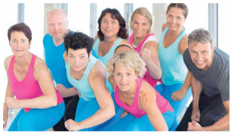
Fascial Movement Instructor and additional qualifications